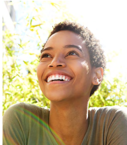
Improved Emotional & Social Health