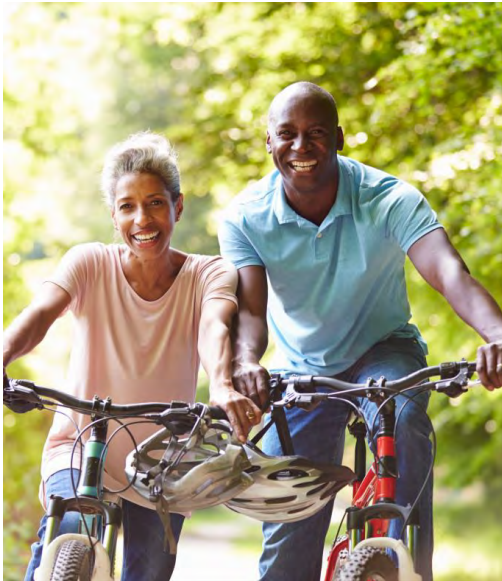
Improved Physical Health